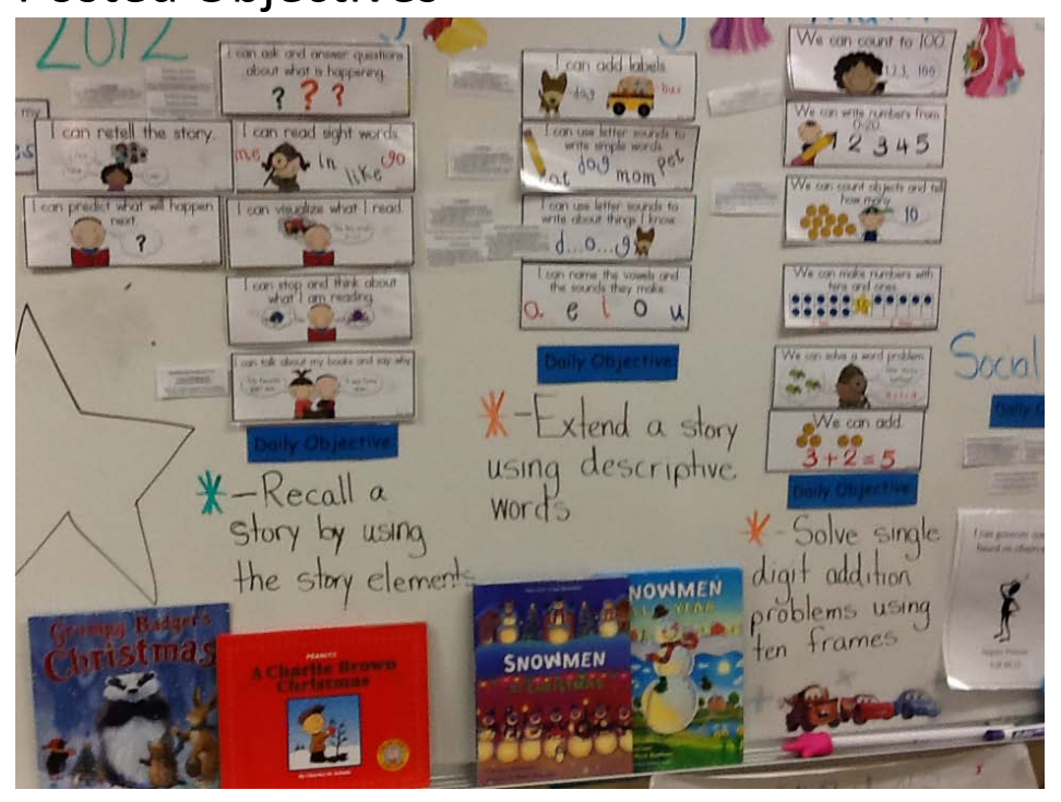
Crystal Woodley Kindergarten (above) and Talia Leonard Second Grade (below)